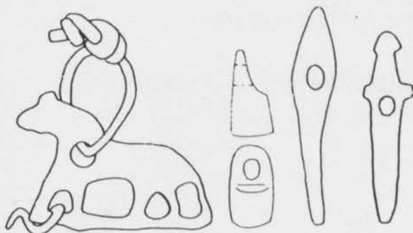
Fig. 1. Pendant miniatures of bronze: horse, sword, spear, chair, from Sweden; provenance unknown. Museum of National Antiquities, Stockholm. (Drawing from Arrhenius 1961.) — Miniaturer av brons: hest, sverd, spyd og stol fra Sverige, ukjent funsted.

tures which have been found in situ in graves seem normally to have been suspended from a necklace rather than a chatelaine. This facilitates their distinction from toilet implements, but raises the possibility of their being ornaments. For instance, the Viking sieve spoon normally lacks a handle, and its position on a necklace suggests that its function was amuletic or ornamental rather than practical. (Duczko 1985, pp. 47 f.; Meaney 1981, p. 152. For a practical function of those on chatelaines see Gräs-lund, 1978–79, esp. p. 299.) Circular shield-shaped pendants of bronze or silver are found on necklaces from the 10th century. Since they are not usually associated with other miniature weapons, they may have been regarded as ornaments although their form and decoration coincide strikingly with early Anglo-Saxon examples (e.g. Arbman, 1940, Pl. 97:1–20; Duczko, 1985, p. 50; Meaney, 1981, Fig. V:6). In addition to those from Western Europe, Scandinavian Viking miniatures include spade-like objects, scythes, strike-a-lights and staffs (Arrhenius, 1961). Their precise symbolic connotations are unknown, although Odin, Thor and the fertility god Freyr have been mentioned in this connection (Arrhenius, 1961; Andersen, 1971). Miniature chairs are apparently peculiar to Scandinavia. So far, 13 examples are known from Sweden (incl. Gotland) and Denmark