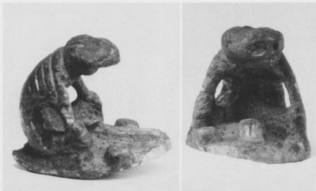
Fig. 6. Grave amulet of bronze: frog or toad crouching behind female genitals (?), from Sønderteglård, Jutland, Denmark. Viking period, probably 10th century. Danish National Museum, Copenhagen. — Gravamulett av bronse: frosk sammenkrøpet bak en vulva (?). Vikingtid, sannsynligvis 900-tallet.

seems to be both a regional and a chronological distinction between the iconographies: a man and woman rendered on separate sheets appear to be pre-Viking and mainly South-east Scandinavian (Fig. 7), while the couple is of Viking date and has a pan-Scandinavian distribution (Fig. 8; Stenberger, 1973). Although the identification of the figures with specific gods is uncertain, the facing and sometimes embracing pair is probably a fertility symbol (Nordén, 1938; Blindheim, 1959; Holmqvist, 1958; Lidén, 1969). The pieces have no sign of fastening, and their diminutive size and fragility argue against a practical or ornamental function. The earliest are pre-Viking (Stenberger, 1973) and they seem to have continued through most of the Viking period. Some have been found singly, but surprisingly often they occur together in large numbers, e.g. 26 at Helgö, Sweden, 19 at Mære, Norway (Gustafson, 1899; Holmqvist, 1958, Lidén, 1969). The latest, exciting discovery of hundreds of such pieces in one locality on the Island of Bornholm