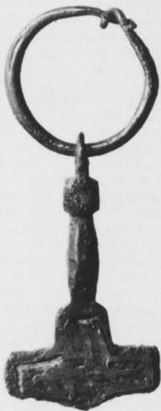
Fig. 3. Pendant hammer of silver from Birka, grave 750. 10th century. Museum of National Antiquities, Stockholm. — Miniaturhammer av sølv fra Birka, grav 750. 900-tallet.

Miniature hammers occur in pre-Viking times both in Scandinavia and in England (Fig 3; Schwarz-Mackensen, 1978, p. 85 with refs.; Meaney, 1981, p. 151). But their number increased markedly in Viking-Age Scandinavia. The material is iron, bronze, occasionally amber, and — from the 10th century onwards — silver. They are predominantly, though not exclusively, found in women's graves, while most of the silver examples come from hoards of the late 10th and the 11th century (Stenberger, 1958, esp. pp. 167–171; Ström, 1984, esp. p. 136). The hammer-shaped pendant is normally interpreted as the symbol of the god Thor, an interpretation based on contemporaneous