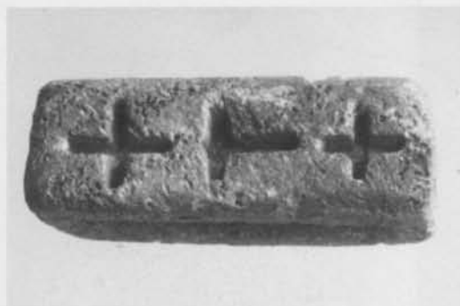
Fig. 4. Casting mould of soapstone from Trendgården, Jutland, Denmark. Danish National Museum, Copenhagen. — En støpeform av klebersten fra Trendgården, Jylland.

iconography and on later but fairly reliable literary evidence. Its amuletic significance is taken to be generally prophylactic. The proliferation of silver hammers in the 10th and 11th centuries has occasionally been interpreted as a pagan riposte to the Christian pendant cross with became current in the same period. The casting mould from Trendgården, Jutland, demonstrates that cross and hammer were manufactured simultaneously (Fig. 4).