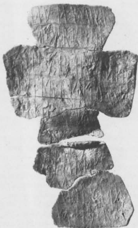
Fig. 9. Runic amulet of lead sheet from Osen, Sogn og Fjordane, Norway. 13th century (?). Historisk Museum, Bergen. — Runeamulett, blyblikk fra Osen, Sogn og Fjordane. 1200-tallet (?). Høyde ca. 6 cm.

tion, e. g. the more than fifty wooden crosses from the Norse graves at Herjolfsnes, Greenland (Nørlund, 1924). Others, such as the Odense sheet, were deposited in churchyard soil or a grave, possibly to transfer illness from the living to the dead (Moltke, 1938 with refs.; Gustavson, 1984). Some have come to light under church floors, inserted between the planks, probably to protect the living (e. g. Liestøl, 1978; Olsen ed., 1940 ff., vol. 4, No. 348, pp. 140–143). Others again have been found in towns under circumstances which indicate that they had been accidentally lost and hence presumably worn by their owners (e. g. Liestøl, 1980, No. 637, pp. 73–77, from Bergen; Gus-