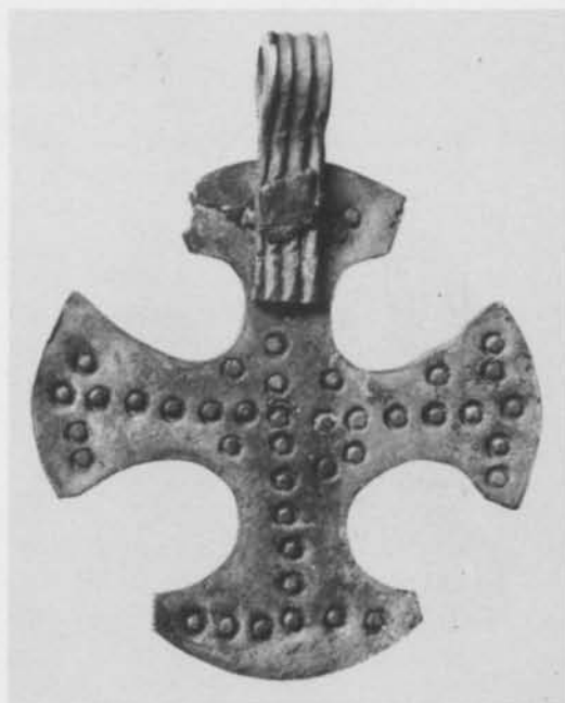
Fig. 5. Pendant cross of silver from Birka, grave 480. 10th century. Museum of National Antiquities, Stockholm. — Hengekors av sølv fra Birka, grav 480. 900-tallet.

Cross pendants have been found in all parts of Scandinavia (Fig. 5). Some, particularly bronze crosses, are found in graves, but most of the surviving pieces are of silver and have been recovered from hoards (Stenberger, 1958, pp. 171–181; Müller-Wille, 1976, pp. 37 f.; Gräslund, 1984 with refs.). Crosses in graves are at times associated with other types of amulet pendants, in Birka grave 968, for instance, with a miniature chair which is usually interpreted as a symbol of Odin, the figure of a small woman, possibly a pagan “valkyrie”, and a shield-shaped pendant (Gräslund, 1984, p. 115). Another grave contained both a cross and a Thor’s hammer (Birka grave 750; Gräslund, 1984, esp. p. 118). Similarly, a grave in Taskula, Finland, had a pendant cross and a miniature axe (Kivikoski, 1965, p. 32). Such combinations of pagan and Christian amulets correspond to the occurrence of cross pendants in graves showing pagan ritual, and probably reflect individual vagaries in the period of transition to Christi-