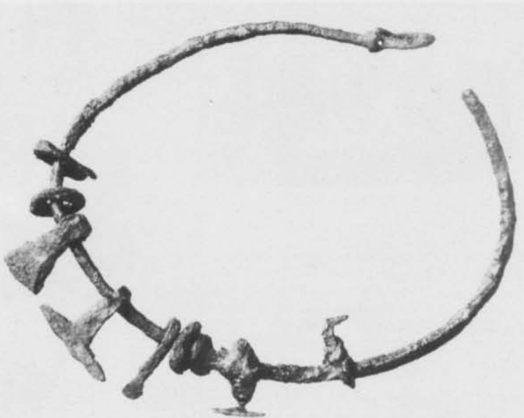
Fig. 2. Votive ring from Birka, grave 985, Uppland, Sweden. Viking period. Museum of National Antiquities, Stockholm. — Votivring fra Birka, grav 985. Vikingtid.

cult of Thor seems reasonable, and their regional distribution is striking. But it should not be overlooked that they bear a marked resemblance to small rings with miniatures of both iron and other metals found in other areas of Scandinavia (e.g. Arrhenius, 1961; Andersen, 1971; Müller-Wille, 1976).